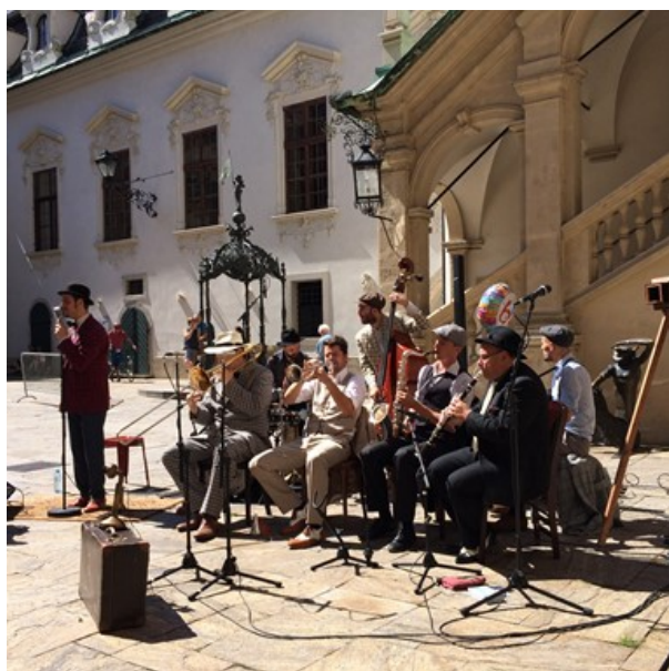
Graz – the city of jazz in a classical environment