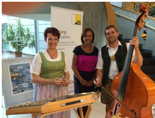
Members of the Styrian folklore band together with one of the delegates from Puerto Rico at the welcoming party

Want to See More Photos of the Graz 2016 Conference?